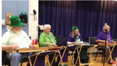
The CP Rochester SDP received a visit from a local Dulcimer group to share their love of Irish Music.