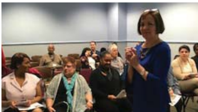
Rochester Rehabilitation's WorkForce Academy Customer Service Basics Graduation, Class of March 2018.