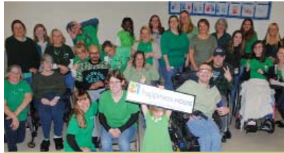
Happiness House SDP participated in the 2018 Brain Injury Association of New York State "Blue Jeans for Brain Injury" Campaign.