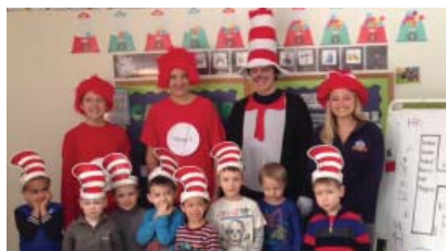
Read Across America! The Kids Miracle Making Club and many special guests joined us to read Dr. Seuss books.