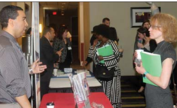
Networking opportunities at our vendor tables