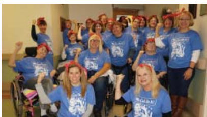
The Women's Group of Happiness House SDP honored the accomplishments of inspirational women.