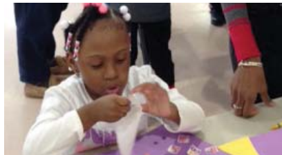
CP Rochester preschool kids celebrated Valentine's Day with help from RIT student volunteers.