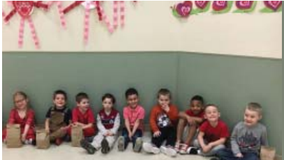
The Blue Room preschool class at Happiness House Canandaigua held a Valentine's Day Dance.