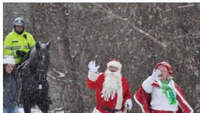
Santa and Mrs. Claus visited CP Rochester with some help from our friends on the Mounted Patrol.